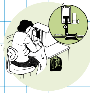
Industrial Sewing Machine