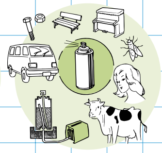
Various Aerosol Sprays